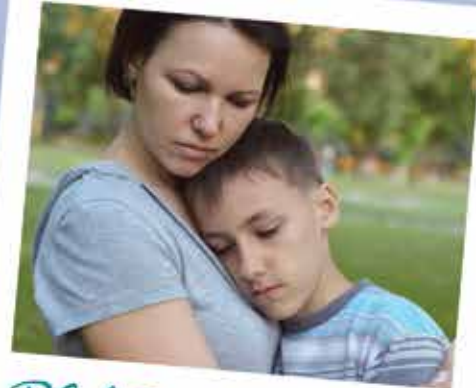
PALS Grief Support